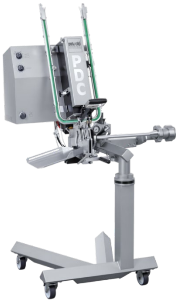
Poly-clip System PDC 700 – semi-automatic double clipper, with split magazine rack for ergonomic clip loading.