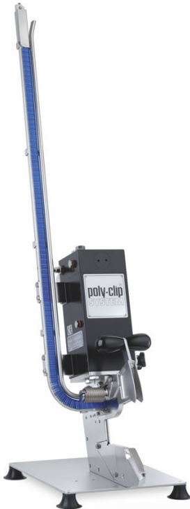
Poly-clip System SCD 700 – half-automatic clipping machine with hygienic design.